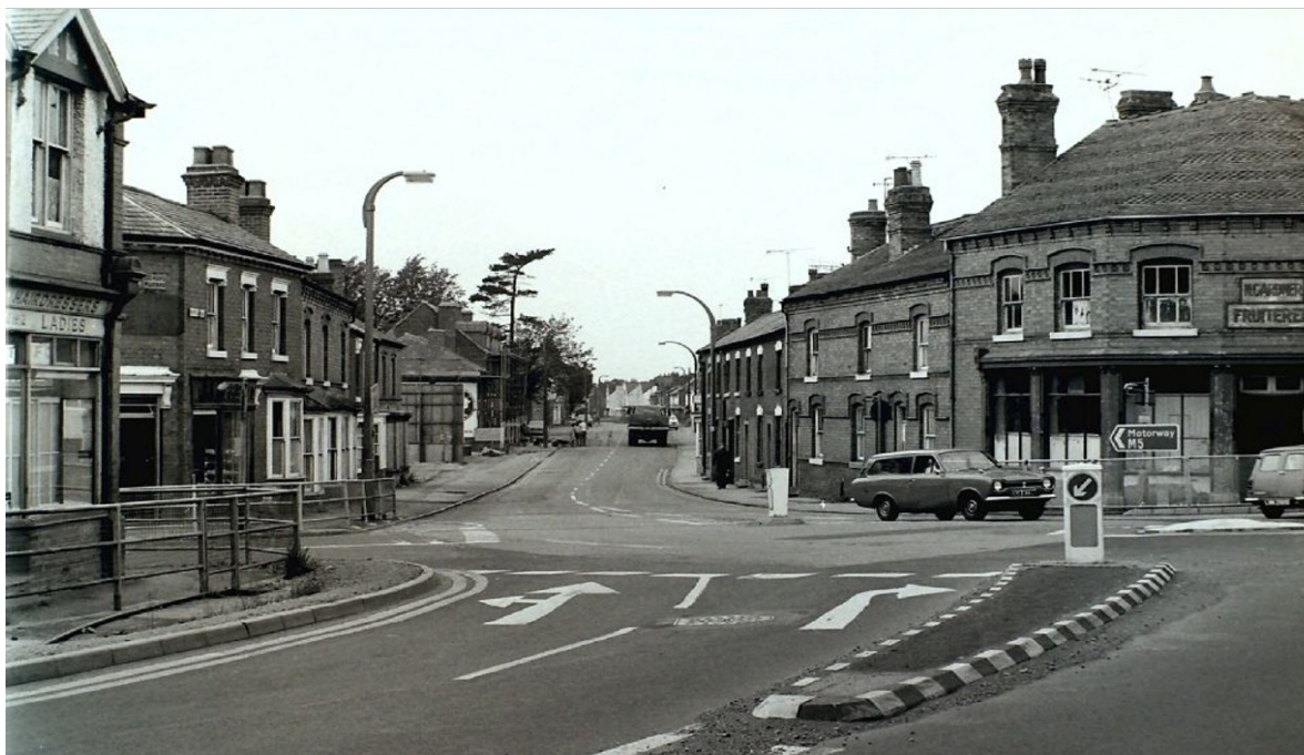
The Eastern end of Birchfield Road at Headless Cross